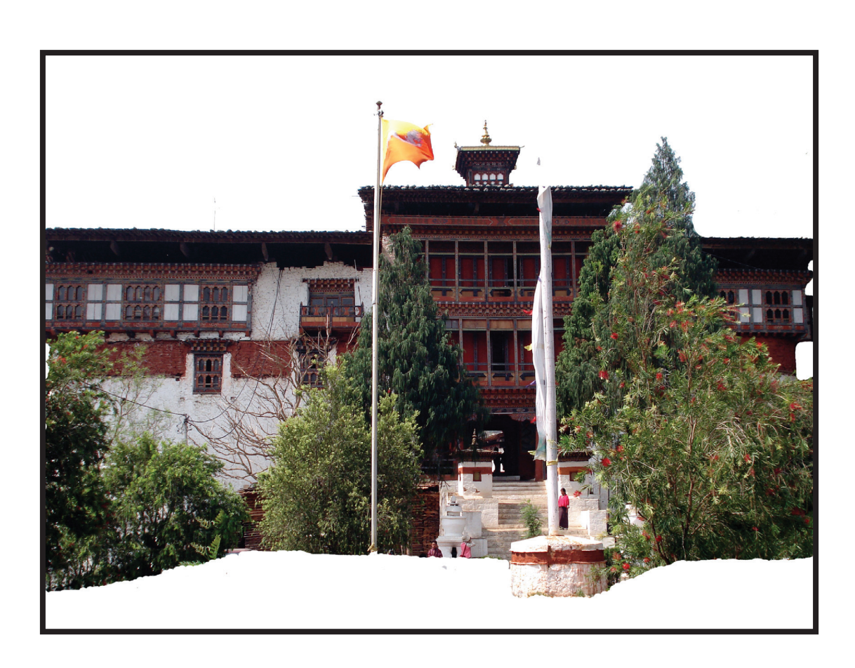
Dzongkhag Administration WANGDUE PHODRANG